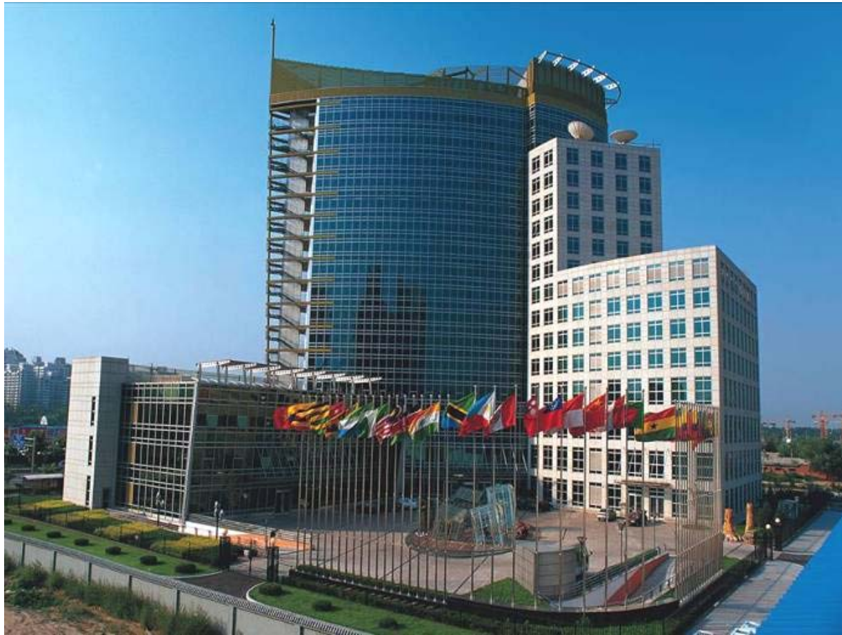
ICBR Tower picture taken in 2005